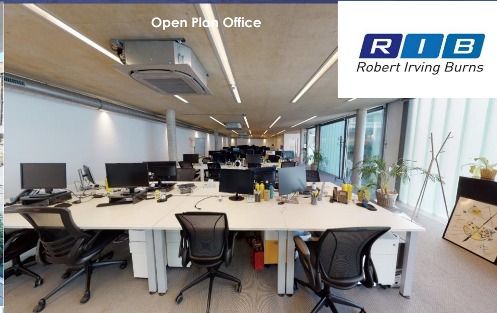
Open Plan Office