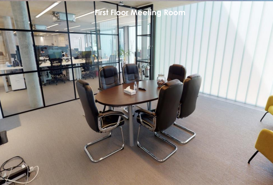
First Floor Meeting Room